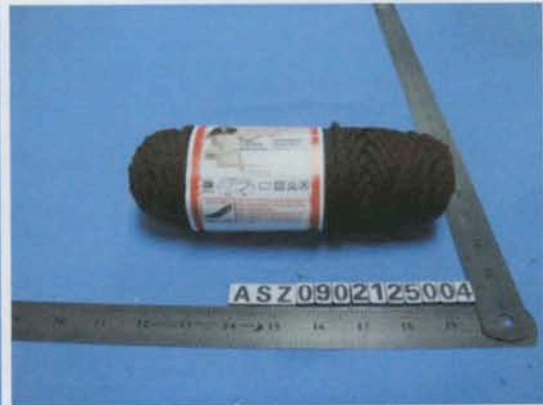
BROWN CRAFT CORD