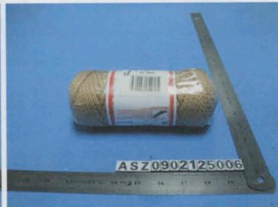
TAN CRAFT CORD

This Test Report is issued by the Company subject to its Conditions of Issuance of Test Report printed overleaf or attached. The results shown in this Test Report refer only to the sample(s) tested unless otherwise stated and such sample(s) are retained for 30days only. This Test Report shall not be reproduced expected in full, without written approval of the Company.