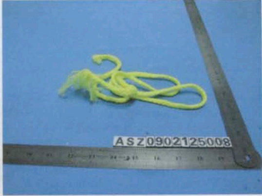
NEON YELLOW CRAFT CORD