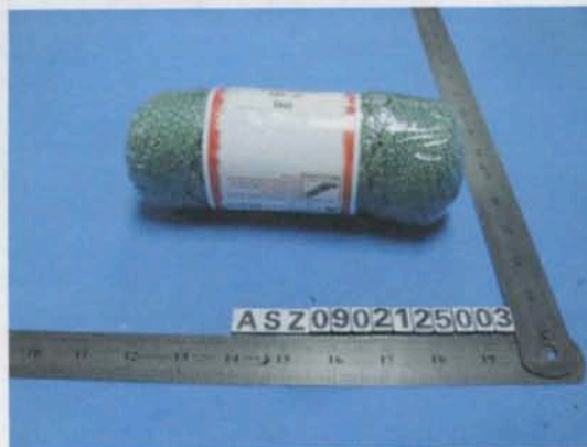
SAGE CRAFT CORD