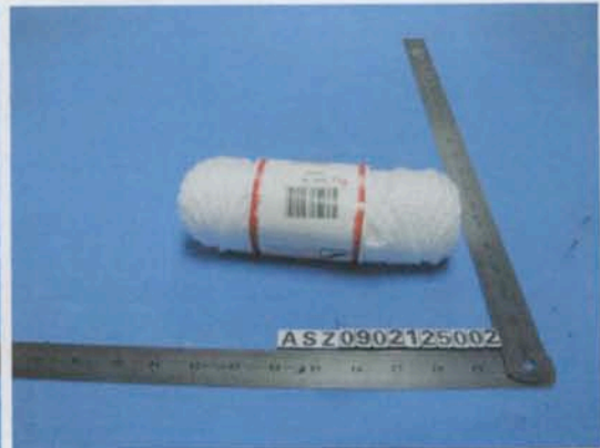
WHITE CRAFT CORD