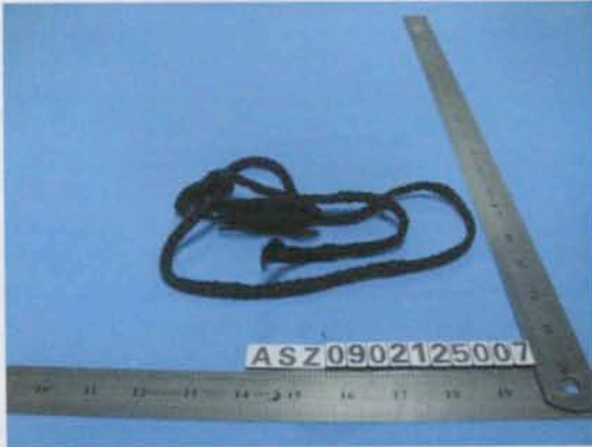
BLACK CRAFT CORD