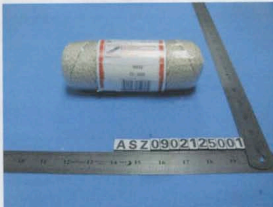
PEARL CRAFT CORD