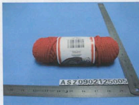
RED CRAFT CORD