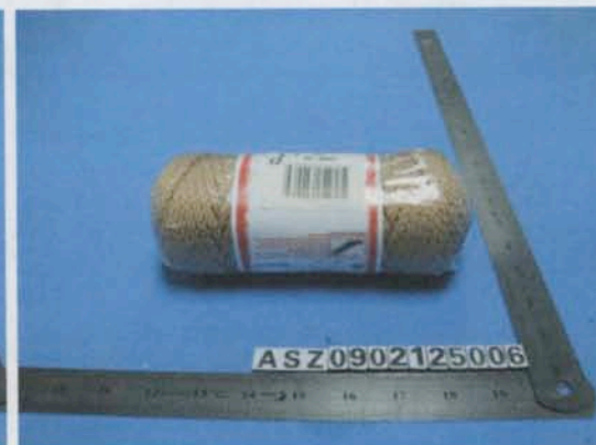
TAN CRAFT CORD

This Test Report is issued by the Company subject to its Conditions of Issuance of Test Report printed overleaf or attached. The results shown in this Test Report refer only to the sample(s) tested unless otherwise stated and such sample(s) are retained for 30days only. This Test Report shall not be reproduced expected in full, without written approval of the Company.