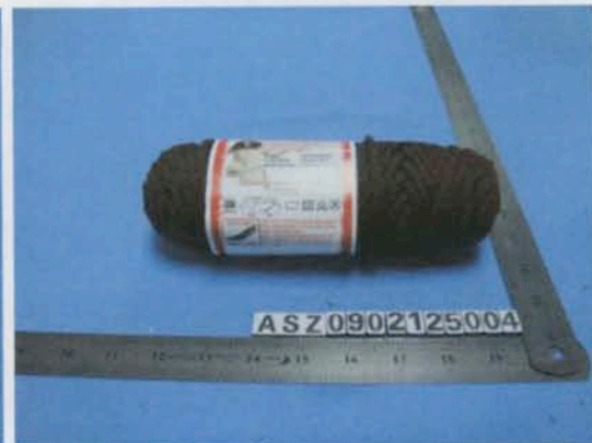
BROWN CRAFT CORD