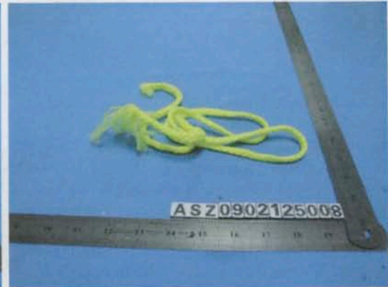
NEON YELLOW CRAFT CORD