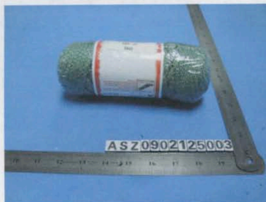
SAGE CRAFT CORD