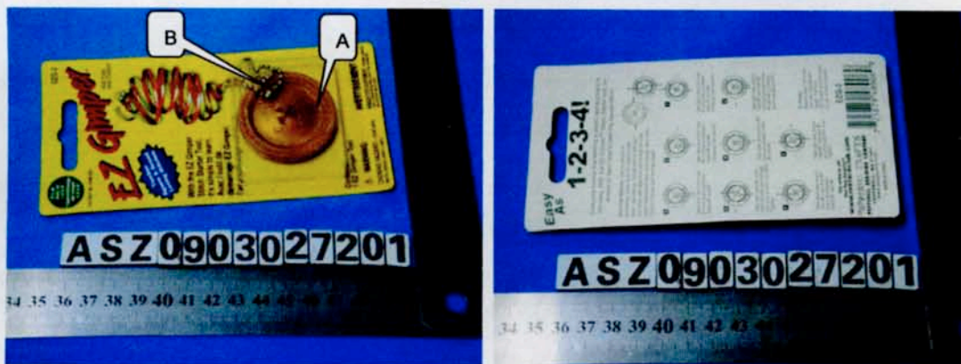
EZG-2 EZ GIMPER