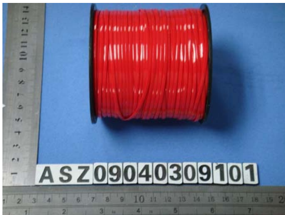
RX-100 RED REXLACE