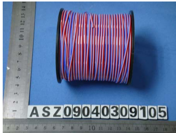
RX-100 RED/WHITE/ROYAL BLUE