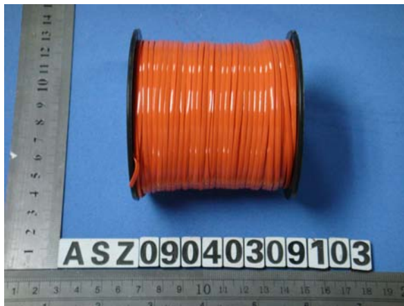
RX-100 ORANGE REXLACE