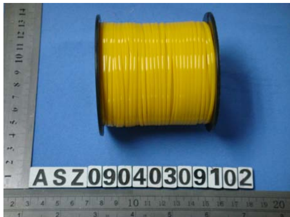
RX-100 GOLDENROD REXLACE