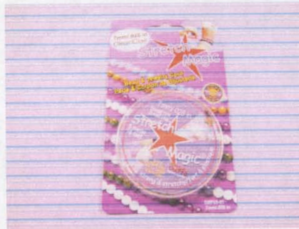
Stretch Magic kits