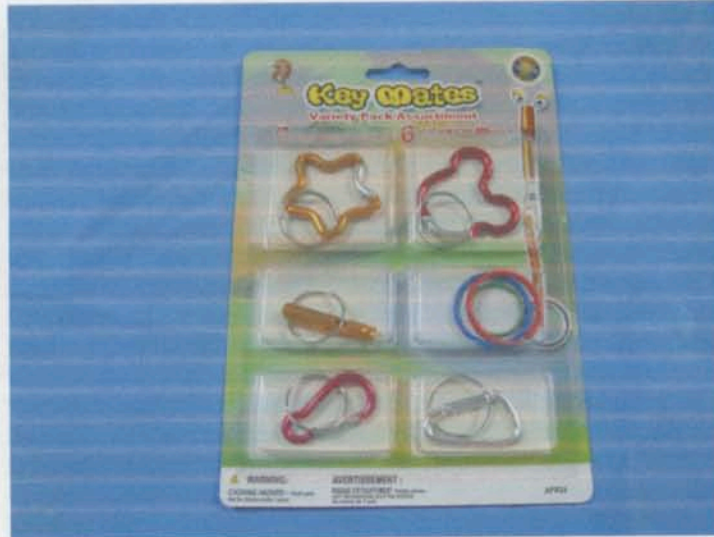
APR24 KEY MATES KITS