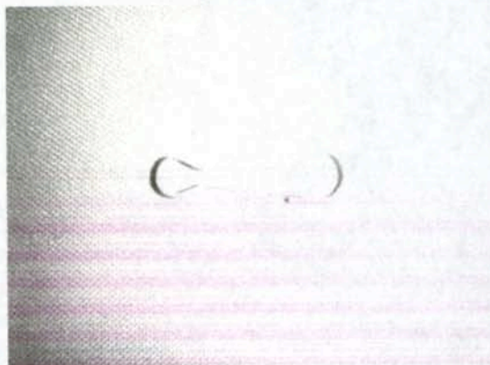
BLUE LANYARD SNAPS