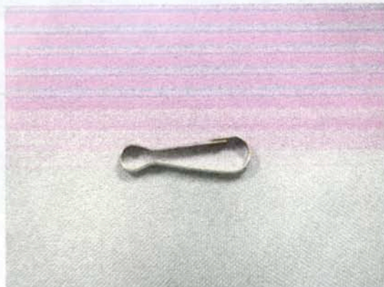
SILVER LANYARD SNAPS