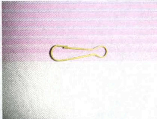
GREEN LANYARD SNAPS