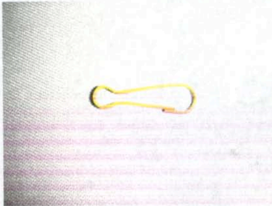
RED LANYARD SNAPS