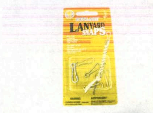
LS-106A REXLACE LANYARD SNAPS KITS